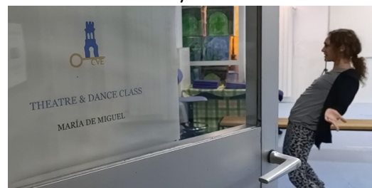
Dance and English class for primary school