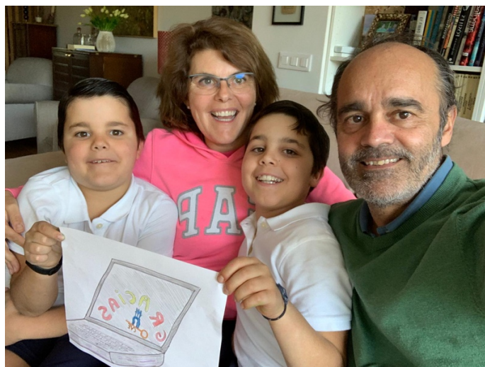
CVE families showing appreciation