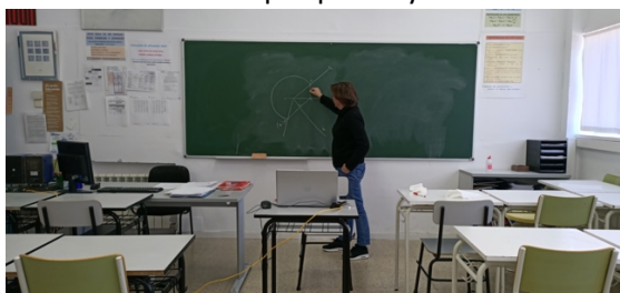
K11 Maths online class