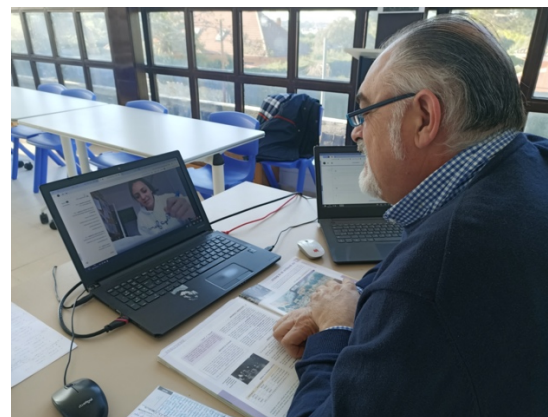
K8 History online class