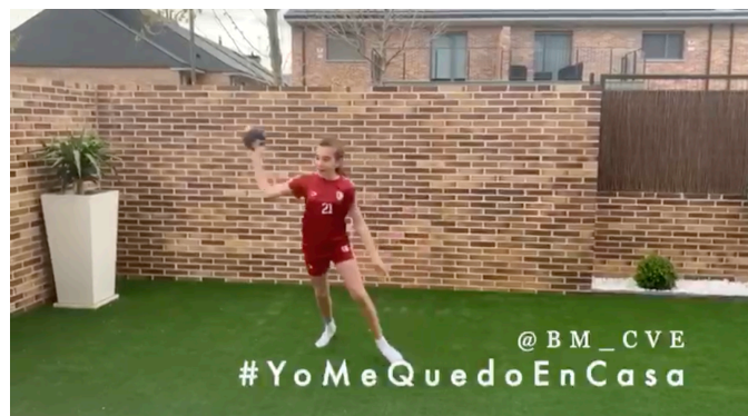
Video from the handball team