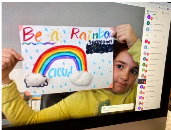
Arts session por primary school

CVE school decided to teach all the topics at all levels to maintain the educational activities as regular as possible. Since the school was closed, online classes started at 9 in the morning and ended around 5 in the afternoon, with some recess and lunch break, mimicking the normal schedules. This commitment has implied proposing many different types of activities since topics as different as language, science, arts or sports have to be covered for students from all levels and ages. To develop all the required skills and keep students active and motivated, teachers have proposed creative pedagogical activities like homemade experiments for science, gymkanas for recess and sports, artistic contexts to use competition as an intrinsic motivator or math bingos to gamify education. This was only possible because the CVE school is strongly active on improving teaching methodologies with active pedagogies that include ICTs, since online learning cannot be improvised in a few days.