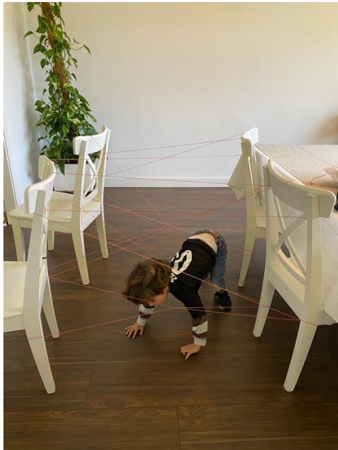
Playing activity for kindergarden