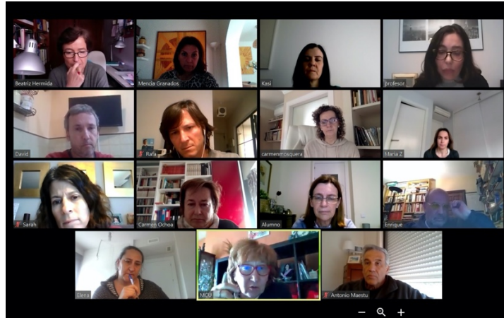
CVE Teachers sharing experiences from home after the lockdown