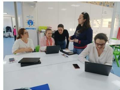
CVE teachers' training before schools closure