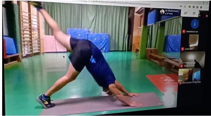
Fitness and stretching online class