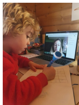
Online class at kindergarden