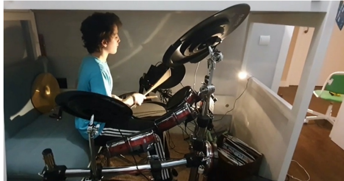
Online music lesson

sports, including the hockey and handball teams, keep doing training exercises and meeting online to keep the team spirit. Both teams recorded a video where each member recorded a throw or pass simulating a group exercise. All recordings were later edited to produce a unique video that was distributed through social media. School teams also participated in an online Debate League with other schools and two contests of photography and short narratives about the lockdown experience have been launched to encourage creativity and self-expression and to collect memories from the school community.