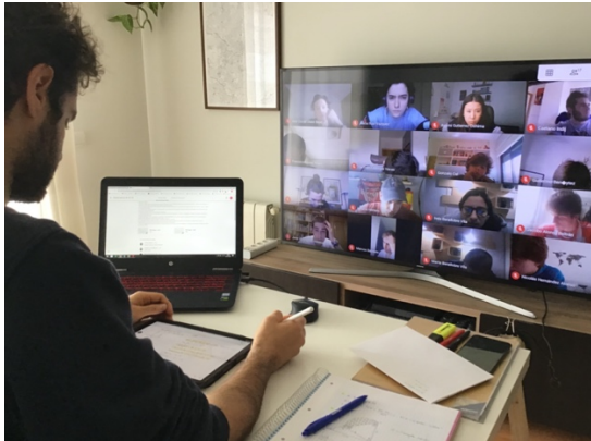
Online exam for IB students