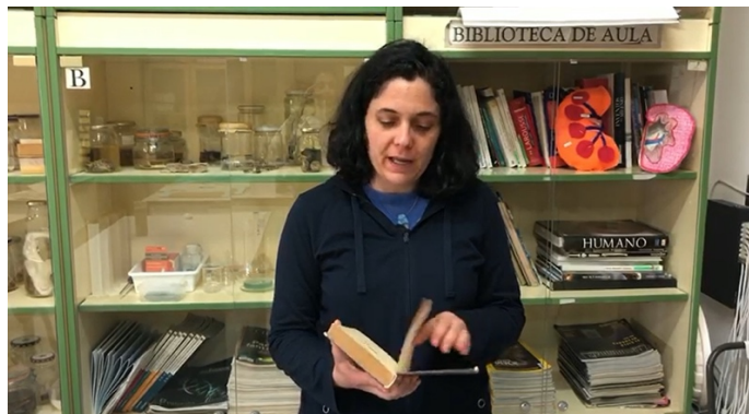
Books recommendation by the Librarian