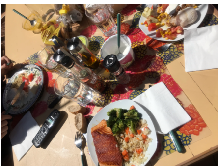
Cooking healthy lunches at home for K12